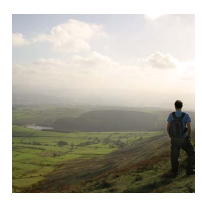
The view from the top of Pendle